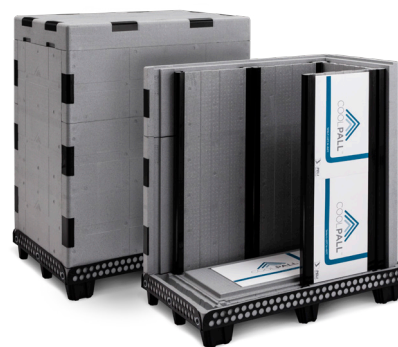
FH - FULL HEIGHT