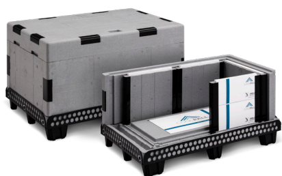
NBA - NARROW BODIED AIRCRAFT